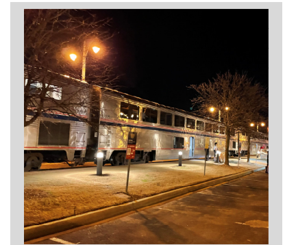
The City of New Orleans standing at Memphis Central Station having just arrived from New Orleans on Sunday, March 25.